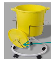
Trolley 4716 with metal lid bracket 4719

USON PLAST A/S is a Danish company with more than 60 years of experience in development, production and international sales of products for the healthcare and medical industry. We specialize in manufacturing plastic products for hospitals, healthcare institutions and laboratories , working also as subcontractors primarily for the medical industry .