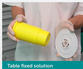
Table fixed solution

Easy, fast and safe discharge of sharps with only one hand.