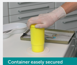
Container easily secured