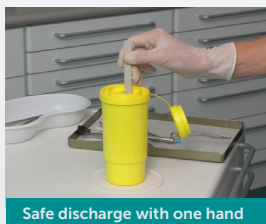
Safe discharge with one hand