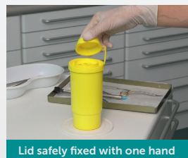
Lid safely fixed with one hand