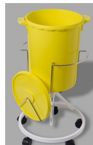
Trolley #4716 with metal lid bracket #4719