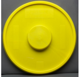
Solid lid with grip